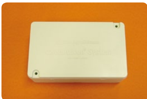
Sentricon AG Termite Bait