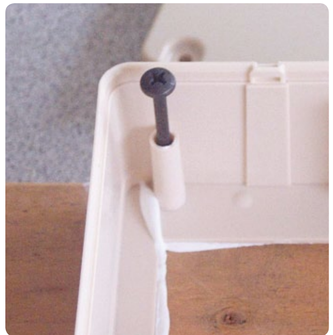
Picture 10: Screws are supplied with Sentricon AG stations, which can be used to help secure the station to a wooden surface.

Your objective when installing a Sentricon AG Termite Bait station is to create an environment inside the station in which termites would happily feed. This generally means completely sealing the station with a sealant like No-More Gaps so that moisture can't escape and the termites can maintain the humidity and CO2 levels inside. Sealing the station also helps to hold in onto the termite active surface as well as helping to keep out termite predators such as ants.