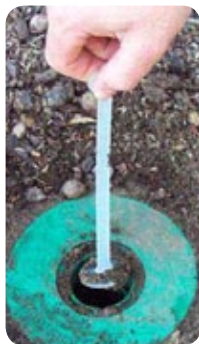
Picture 7: Extractor that has been modified to clean out debris from inside IG stations in case no other tool is available.