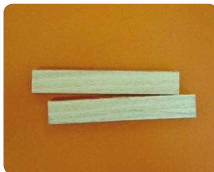
Monitoring Device (pair)