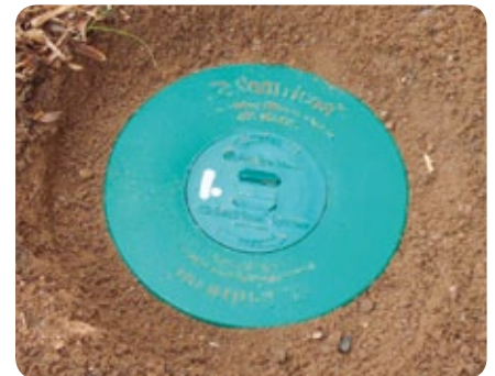
Picture 1: Shows Sentricon soil-cover sitting flush with the soil surface, also shows station number.

channel so that when the auger is turned the monitoring device clears a circular, flat surface for the soil-cover to sit (see picture 2).