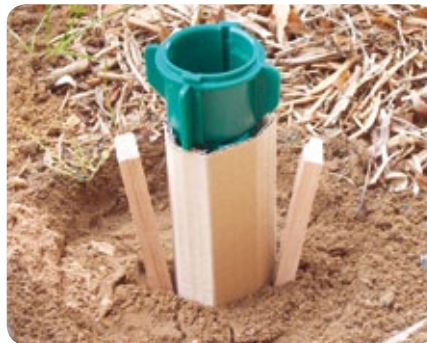
Picture 3: IG stations should be installed with at least 2 external monitoring devices. To prevent soil from falling into the station during install wrapping it in cardboard can be beneficial.

To aid identification of IG stations at monitoring visits it is strongly recommended that you number the station with a permanent marker pen designed for outdoor use (see picture 1). Mark the location of each IG station on your site map.