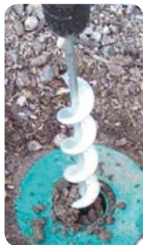
Picture 6: Cordless drill with auger attachment for cleaning out IG Stations.

a) When MDs do not sit flush in the station making it difficult for the locking cap to fit. In these situations loose soil or debris has likely fallen into the station preventing the extractor from sitting at the bottom of the station. Assuming termites are not present, you will need to clean out the station using an augering tool attached to a cordless drill (see picture 6) or a modified extractor can be used if there is not too much to clean out (see picture 7). A little water poured into the hole may assist with lifting out loose sandy-like soils and debris.