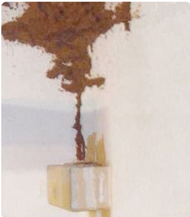
Picture 12: When additional bait is required, the Sentricon AG station can be double stacked so as to prevent disturbance of the feeding termites below. Note: masking tape is used to help hold the AGs on the wall while the sealant dries.