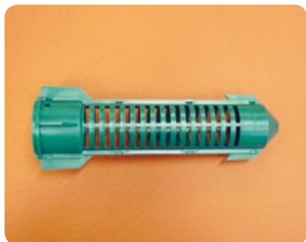
IG Station housing