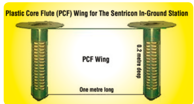
Diagram 1: PCF Wing placed between two IG stations.

Additional external MDs around the IG station has been shown to improve the performance of the PCF wing as they provide extra food for the termites helping to establish the station as a preferred feeding site, as well it reduces the risk of station abandonment. Once you bait one IG station always bait the IG station at the other end of the PCF wing as termites are likely to encounter that station too.