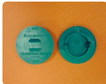
Locking Top Cap