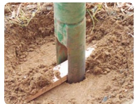
Picture 2: Shows MD in auger channel, a technique used to create a flat base for the Sentricon soil-cover. Can be used to remove lawn thatch, gravel or mulch.