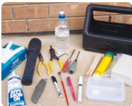
Diagram 2: (above) Basic equipment recommended to be carried when monitoring Sentricon IG and Sentricon AG stations. (right) Useful tools for installing IG Stations: Nylon Station Insert, Mallet and Sliding Hammer.