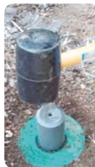
Picture 5: Nylon station insert & Mallet IG Station.