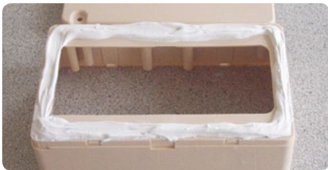
Picture 8: No-More Gaps sealant applied to the base of a Sentricon AG station

Sugar solution should be made fresh daily. A 10% solution is commonly used which equates to approximately 100 grams of brown or white sugar to 1 litre of water. Always use water from a source that is known not to contain potential termite repellants such as chlorine or pesticides. Do not use cold water from the fridge.