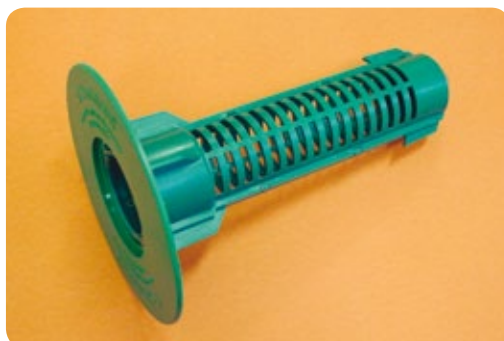
Sentricon In-Ground Station - comprising of: