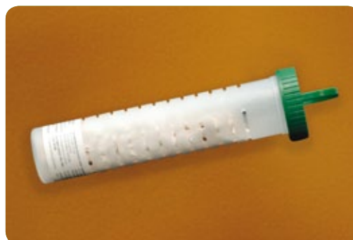
Sentricon IG Termite Bait